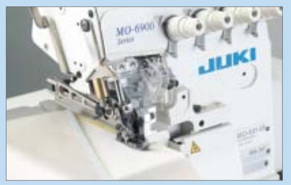
Runstitching in general fabric MO-6914S-BE6-307

Since the machine comes with a needle-thread take-up mechanism as well as a looper thread take-up mechanism, to offer upgraded responsiveness from light- to heavy-weight materials with a lower applied tension, it achieves well-tensed soft-feeling seams that flexibly correspond to the elasticity of the material at the maximum sewing speed of 8,000 to 8,500rpm. To offer improved sewing capabilities as well as to prevent stitching misshapes, the machine is equipped as standard with the needle thread heat remover and needle cooler.