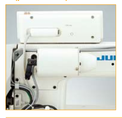
Gathering attachment Q036 For high-quality gathering, both effectively and consistently.