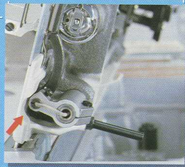
Feed eccentric pin

In addition, the machine is provided with a mounting seat for attachment to improve workability while replacing the attachment and increasing the durability of the machine bed surface.