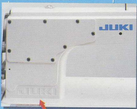
Embossed JUKI mark

● To order, please contact your nearest JUKI distributor.